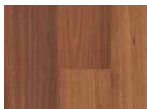
655 Forest Red